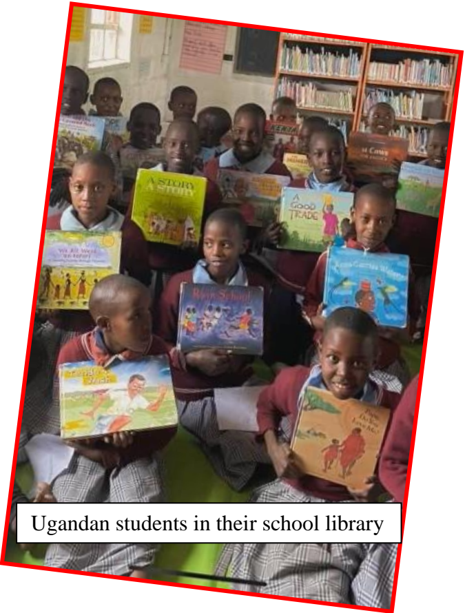
Ugandan students in their school library