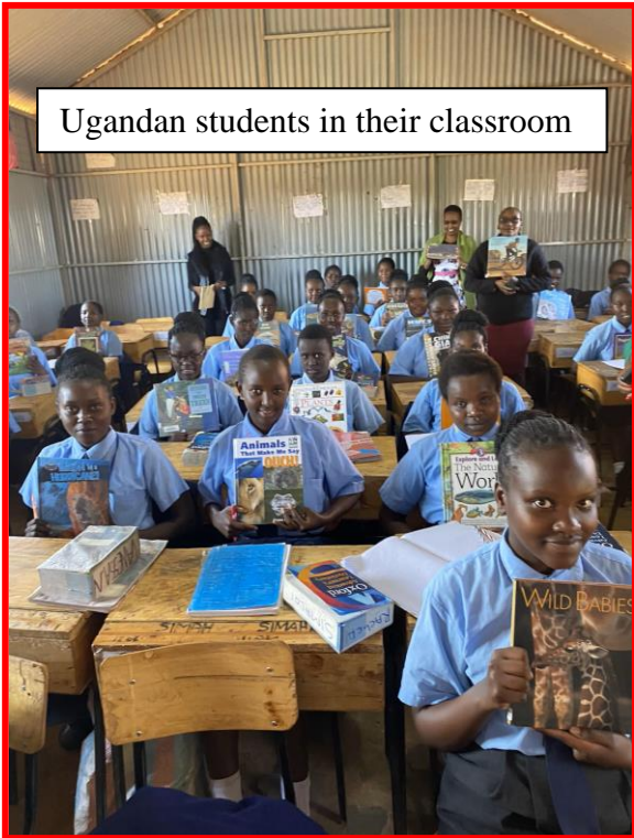
Ugandan students in their classroom